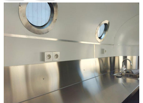
- Countertop -