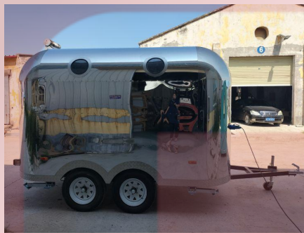
- Rear -