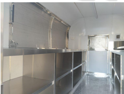
- Workbench -