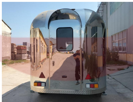
- Door -