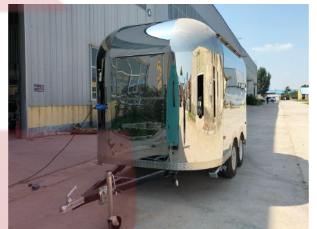
- Generator Receptacle -